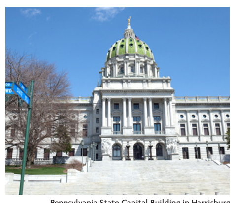
Pennsylvania State Capital Building in Harrisburg

The Surplus Lines Task Force of the National Association of Insurance Commissioners (NAIC), proposed an alternative to SLIMPACT called: the "Non-Admitted Insurance