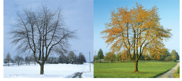
The Consistency of Change