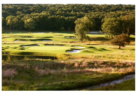
Bedford Springs Old Course

Registration materials for the PSLA's Annual Meeting May 11th & 12th, 2011 will be sent to members in the immediate future.