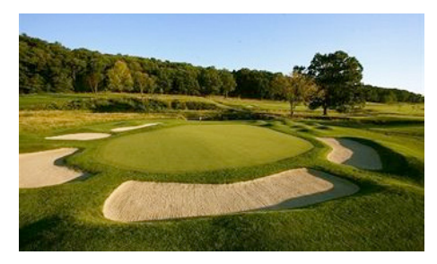
Bedford Springs Old Course