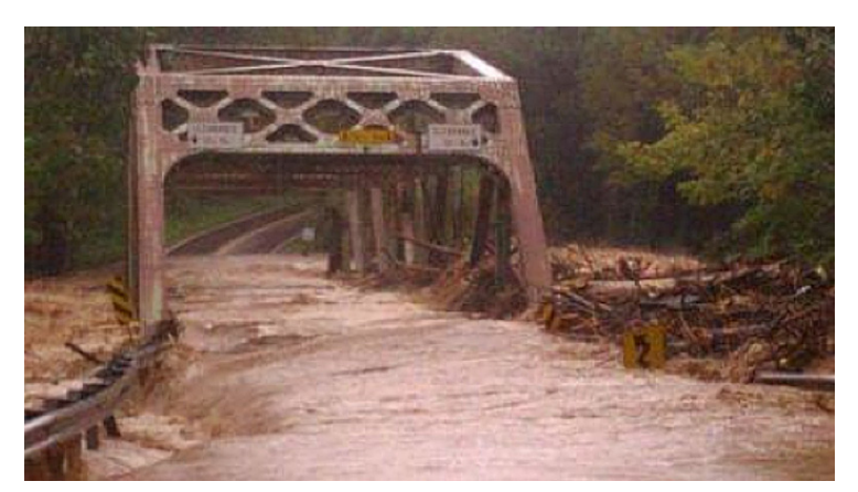
Bridge in Mehoopany, PA (Wyoming County) taken out by Hurricane Irene.