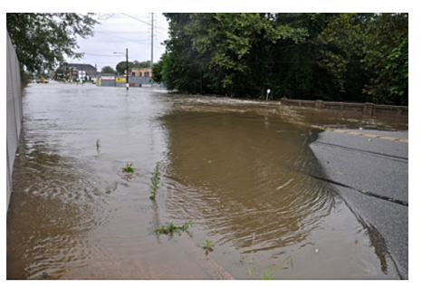
Portions of Chester Pike had to close due to flooding near Eddystone, PA.