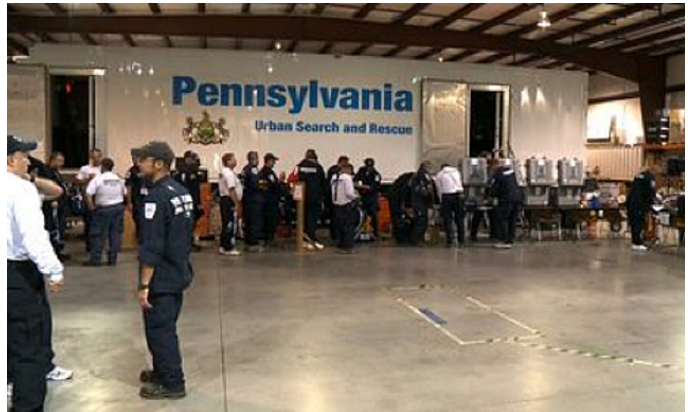
Members of PA's Task Force One return after providing relief to areas hit by Hurricane Irene.