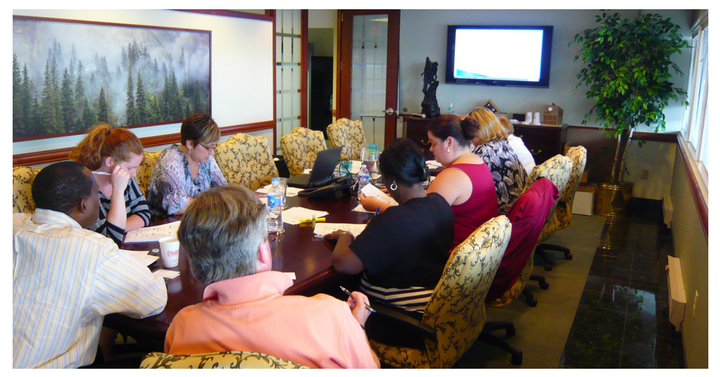
PSLA Members attend the CE Class at the King of Prussia, PA location

Over 40 PSLA members attended an exclusive 4-hour CE webinar on Contractors Liability on September 14, 2011. The PSLA has been offering these electronic webinars as a member benefit all year, as well as to allow members to have access to surplus line experts on topical issues.